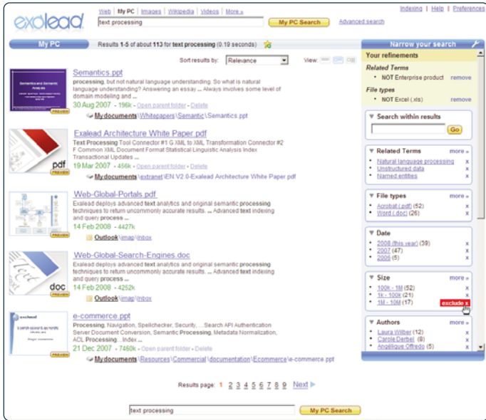
The customizable, brandable search interface helps users find things faster and more naturally.